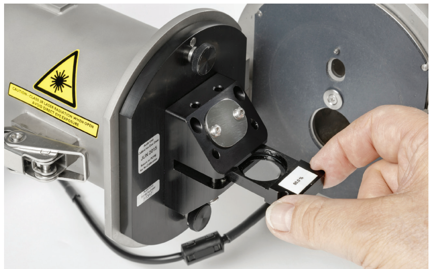
PCME QAL 260 shown with a multi-value Manual Audit Unit and attenuator

The automatic contamination check system (patent pending) ensures that any optical variances are measured, defined and adjusted to ensure zero and span drift is kept to a minimum.