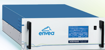
MIR 9000 CLD 19" rack version

EU Regulation IED (WID / LCPD / MCPD directives) and US EPA (40 CFR 60 & 75)