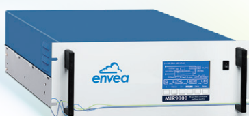
MIR 9000 - 19" rack version

Highly versatile, the analyzer is available in 4U, 19" Rack or Tight box enclosures to fit your application.