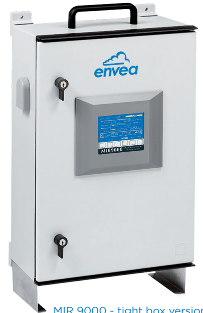
MIR 9000 - tight box version

Highly versatile, the analyzer is available in 4U, 19" Rack or Tight box enclosures to fit your application.